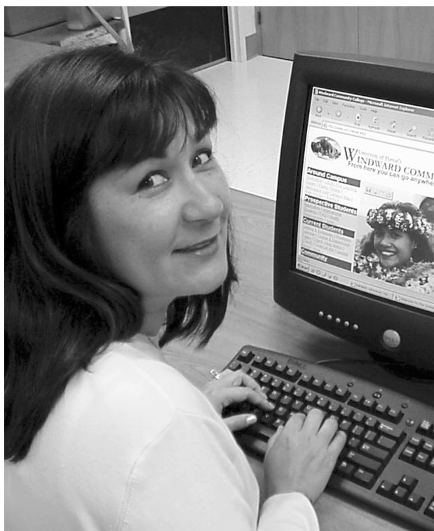
Computers are available all over campus for students to use.

The applications available in the Pālanakila 122 Mac Lab include Microsoft Office (Word, PowerPoint, and Excel), Netscape Communicator, Internet Explorer, Adobe PageMaker, Adobe Photoshop, Adobe Illustrator, and AppleWorks.