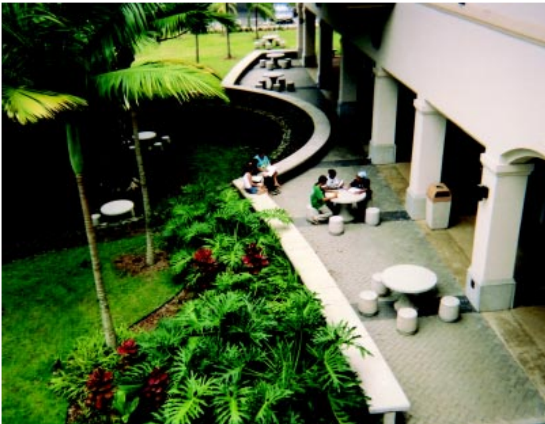
Students enjoy the scenic setting of WCC's new Campus Center.

The College also provides support services such as academic advising, financial aid, tutoring, library services, and career counseling.