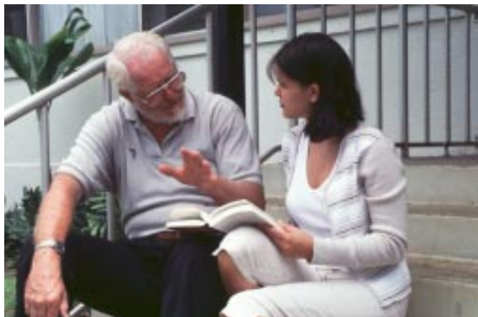
Time with professors is one the advantages of attending WCC.

A copy of the "Rules and Regulations Governing Delinquent Financial Obligations Owed the University of Hawai'i," promulgated by the Board of Regents, is on file in the Office of the Dean of Student Services.