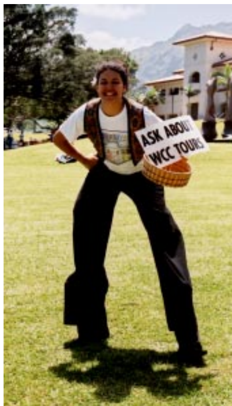
WCC community events give drama students a chance to stiltwalk.