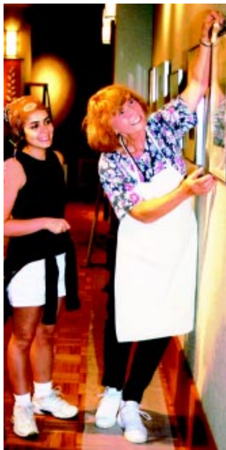
Gallery design is one of the many hands-on art courses at WCC.