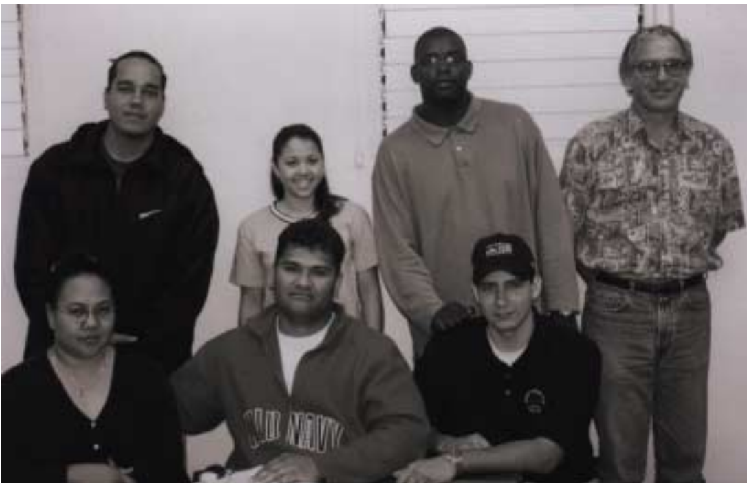
WCC's Student Senate 1999-2000