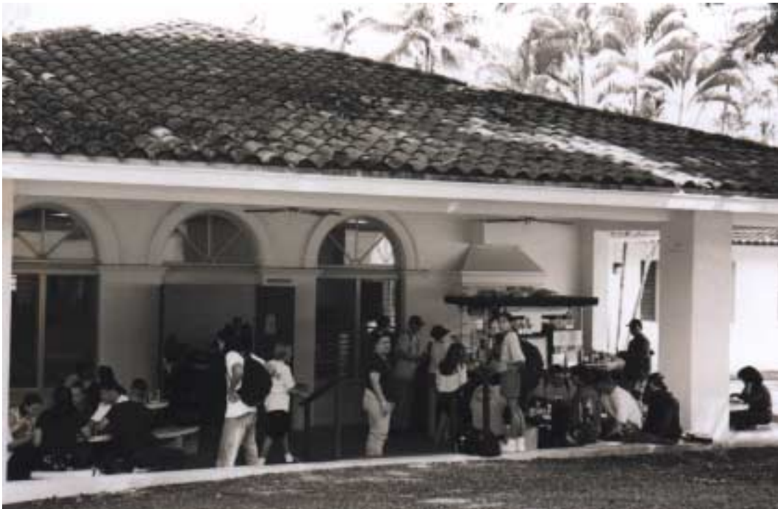
Students relaxing in front of the student lounge.