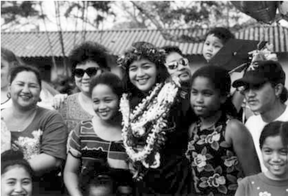
A WCC graduate surrounded by friends and family.

The A.A. degree at Windward Community College is recognized and accepted as fulfilling the general education requirements at all University of Hawai'i baccalaureate degree-granting campuses. The completed degree, however, does not necessarily fulfill all of the program requirements of the various baccalaureate degrees in the University of Hawai'i System. Students are advised to visit one of the academic counselors on campus to review a program sheet for the specific degree being sought - e.g., Bachelor of Arts, Bachelor of Business Administration, Bachelor of Education, etc.