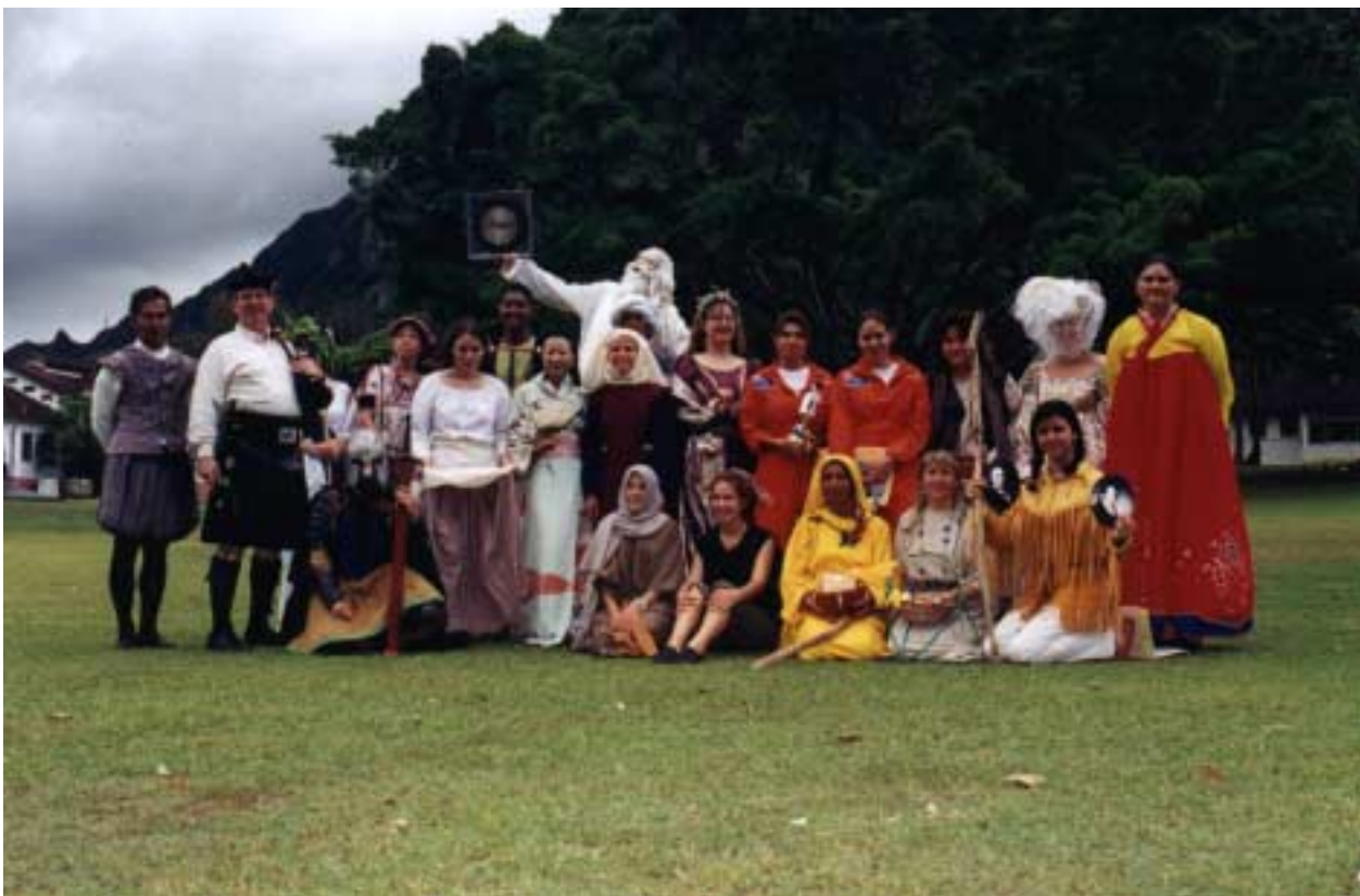
Students from all disciplines participate in WCC's Millennium time walk by representing historical characters throughout the centuries.

Students completing certificate program requirements must successfully complete credits in specified fields and maintain a grade point average of 2.0. At least 50% of the required courses in the major area (the final credits) must be earned at the College. Under certain circumstances, this requirement may be waived upon request made to the Dean of Student Services.