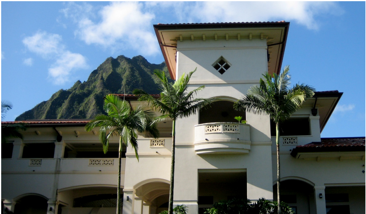
Hale Ākoakoa--“The place to come together, to assemble”