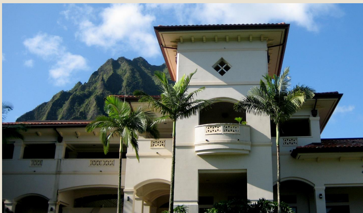
Hale Ākoakoa--"The place to come together, to assemble"